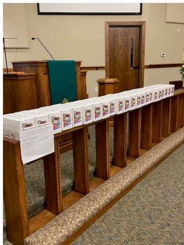
Example of Boys Box