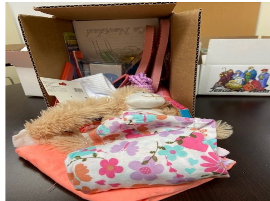
Example of Girls' Box